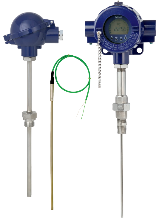
Thermometer in cryo design