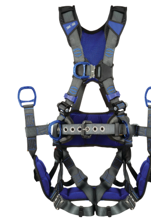
X-Style Tower Climbing (Telecommunications)*