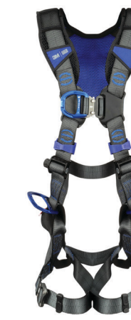
X-Style Climbing/Positioning (Wind Energy)*