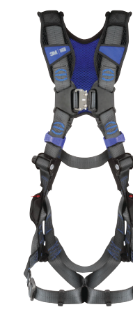
X-Style General Industry

Equipped with contoured form-fitting chest configuration to don easily in 'X' shape. X-Style harness buckle contours to your body, providing an optimal central connection. New horizontal leg straps complement the range of motion workers require on the jobsite.