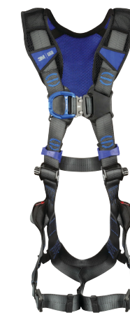
X-Style General Industry Climbing*