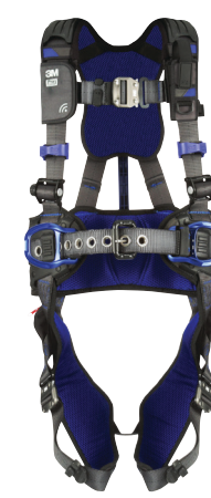
Construction Weight Distribution

Equipped with robust construction hip pad and lightweight back bar to redistribute weight and fatigue from shoulder area.